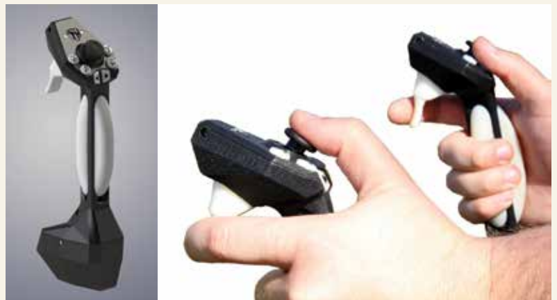
Figure 1 | Tactile feedback device with sliding contactor plates placed around the handle. The contactor plates are independently actuated and slide vertically.

When the sliding tactor plates are actuated in unison in the same direction, the controller communicates a force cue in the corresponding direction along the length of the handle to the user (Figure 2b). When the