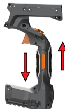
Fig. 2: Force/Torque illusions are created by actuating the sliding contactor plates in response to the user's hand motions.

Reactive Grip™ touch feedback works by mimicking the friction forces experienced by users as if they were actually grasping the object in the virtual environment with which they are interacting. These friction forces are applied through the motion of actuated sliding plate contactors (also called "tactors") that move on the surface of the device's handle (see Figs. 1 & 2). When grasped, the actuated sliding contactor plates induce in-hand shear forces and skin